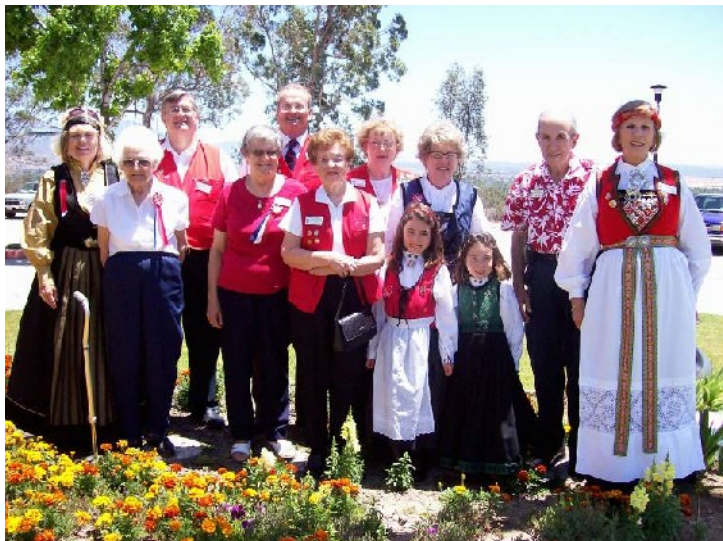
Sundfjord members who attended the 17 th of May celebrations in San Bernardino.