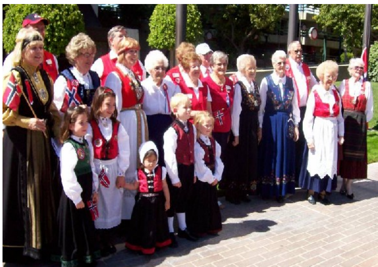
Nice to see so many wearing "bunad" in 101 degrees