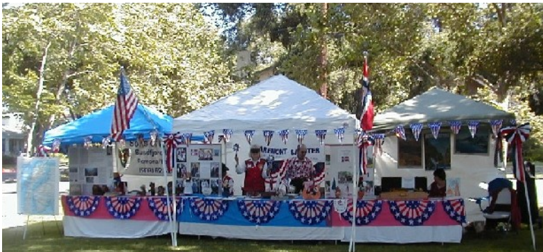
Previous Sons of Norway booth in Memorial Park

Set-up time starts at 8:30 AM and the event goes from 10 AM to 4:00 PM. We need our members to help with set-up and also to spend a couple of hours in the booth.