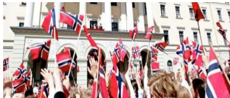
School children passing the Royal palace