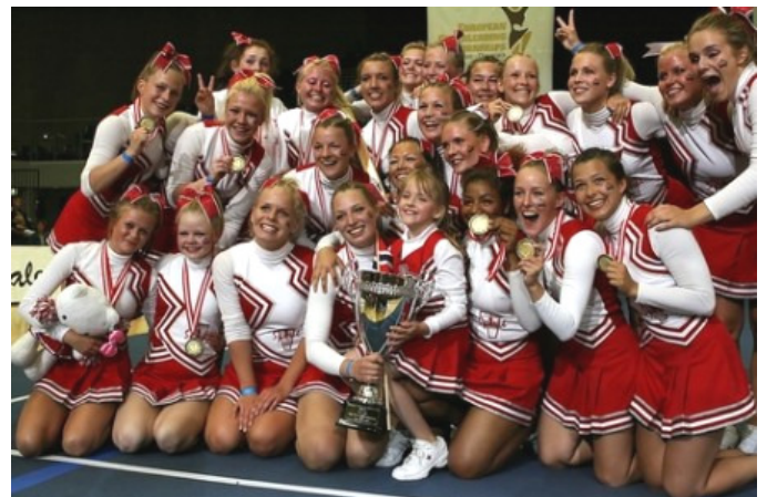
Cheer team “Viqueens” of Oslo is ranked as Norway’s best

Now, however, their ranks seem to be growing and cheerleading is emerging as a sport of its own.