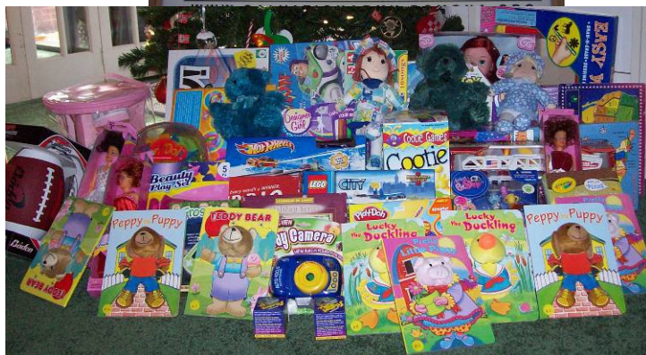
Toys collected for the Salvation Army. Thanks to all our members for their generosity.